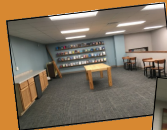
NEW COMMONS AREA