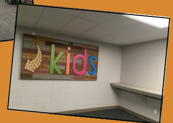
KIDS CHECK-IN COMING SOON!