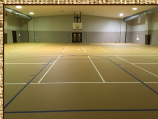
NEW GYM FLOOR